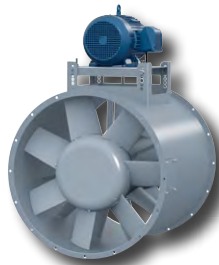
Model TCVX Vaneaxial Fan

Twin City Fan & Blower has the engineering and manufacturing capabilities to accommodate virtually every conceivable application. We have completed thousands of successful installations worldwide and have a proven track record for tackling the most technically complex and unique applications.