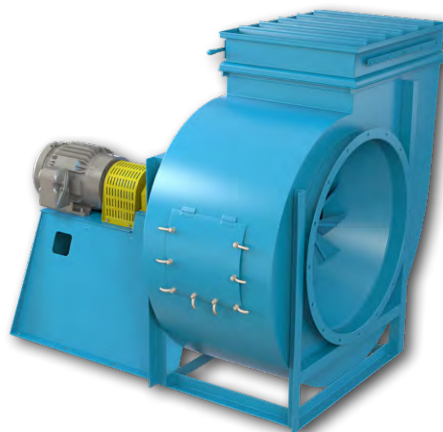
Model BCS Backward Curved Centrifugal Fan

Morning Star's experience with its first TCF fan in 1998 kept the company coming back for more. In 2013, TCF supplied two more fans to replace older underperforming units. Now with its recent expansion, Morning Star knew that Twin City Fan & Blower could not only supply steam-driven fans that satisfy the performance requirements, but could also coordinate deliveries from third-party suppliers as well.